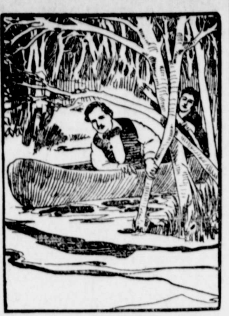
Neil Forced the Dugout Through the Water.

"Ah!" exclaimed Neil, drawing back with a deep breath. "I thought they on won might lie off the point yonder