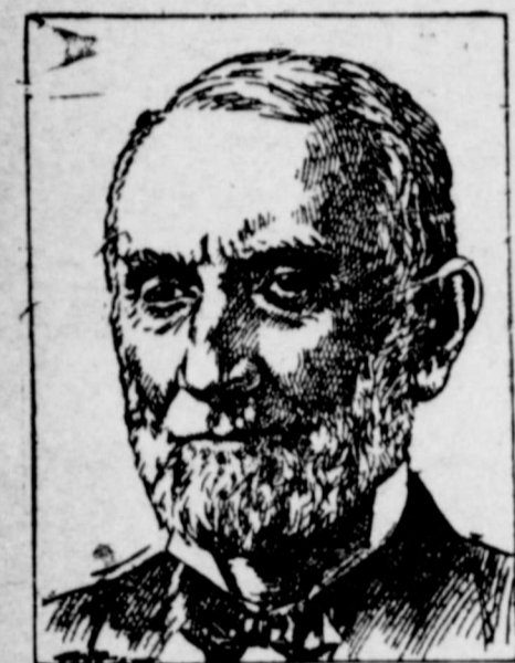
JOSEPH G. CANNON.