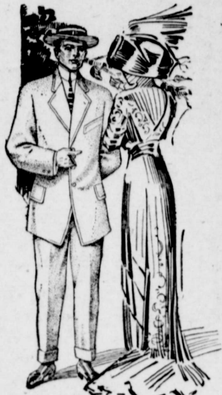
GOLDMAN BECKMAN & CO Good Clothes

Doesn't this spring weather make you feel like getting out of your old suit and get into a new one? We may be a little early but there's method in our display of—