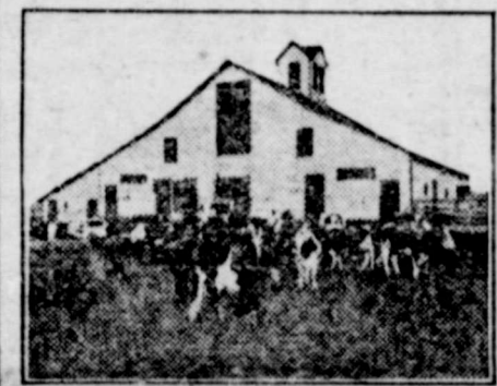
Raised in Yazoo-Mississippi Valley.

The breed of cattle that a man should keep depends entirely upon the purpose for which he is breeding them. If he is breeding for beef alone, he should select one of the characteristic beef breeds. If butter is his sole object, he should breed one of the