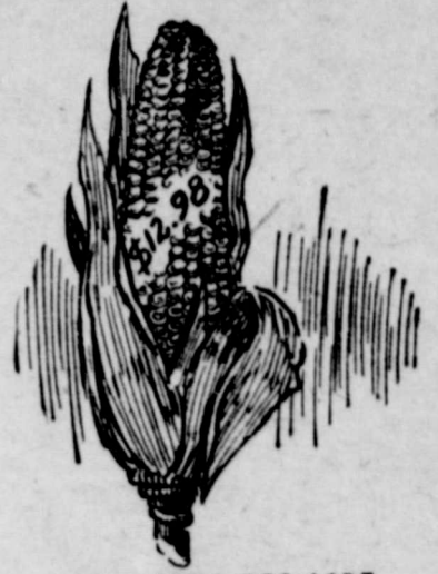
1910 VALUE PER ACRE

Texas is a world's force in agriculture. Withdraw our farm products from the market and the people of two hemispheres will go hungry and shiver with cold. Out of the soil and from the air our farmers take annually nearly a billion dollars of wealth. In plowing the land the Texas farmers walk 330,000 miles per annum, which is equal to traveling around the globe 13,200 times.