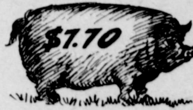
1910 VALUE PER HEAD $7.70.

No domestic animal has ever made such sacrifices to meet the demands of progress as the hog. He has given half of his life and fifty-six pounds of flesh to meet the market demand for young stock. Certainly the human race has made no such sacrifice for success as this dumb brute. According to the census reports of the Federal department of agriculture the average weight of the hog has decreased from 275 pounds to 219 pounds during the past thirty years and he is now going to the market one year earlier than formerly.