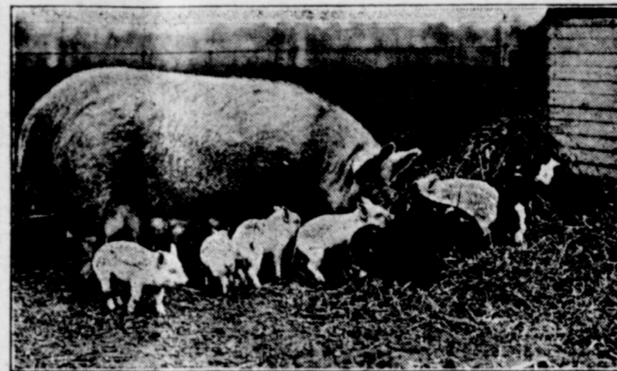
A Profitable Litter.

The pigs will begin to eat when they are about three weeks old, and the more they can be induced to eat the more rapid will be their growth. A feeding place should be provided for them adjoining the pen in which the sow is kept, and so arranged that the pigs can go in and out at will without being disturbed by the sow. A few grains of soaked corn scattered over the floor will soon get the pigs in the habit of eating and they should be encouraged to eat as much as possible. As dry corn will hurt the teeth and make the mouth sore, shorts or oats should be given in the place of soaked corn as soon as the pigs learn to eat fairly well. When the pigs begin to drink they should be given all the skim milk they want if it can be had,