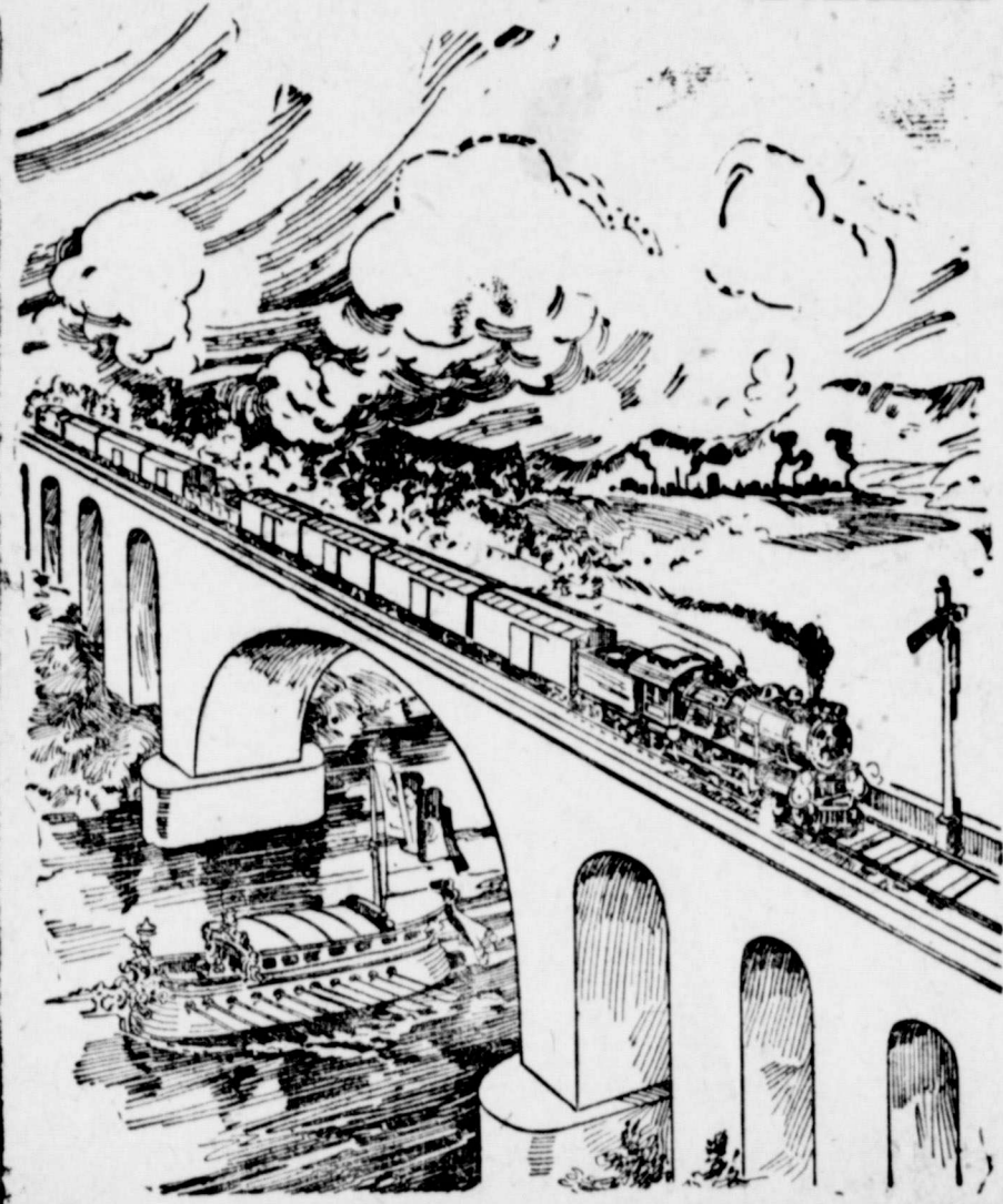
THE BIRTHPLACE OF PROGRESS.

GREEK civilization gave us the arch and made it possible to build structures that support great weights. The Phoenicians made the first boat and the Harbor of Phoenicia became the birthplace of the navies of the world. Since the beginning of creation, we have depended upon men who can build for our progress. We need in State government builders who can construct an arch strong enough to support the ponderous machinery of Twentieth Century civilization and create conditions that will make Texas the birthplace of the world's progress.