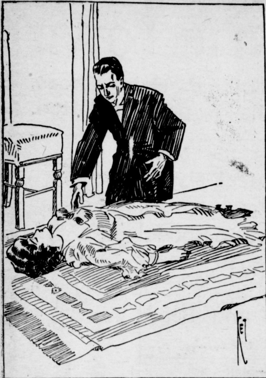
In a Stride He Was Beside Her.