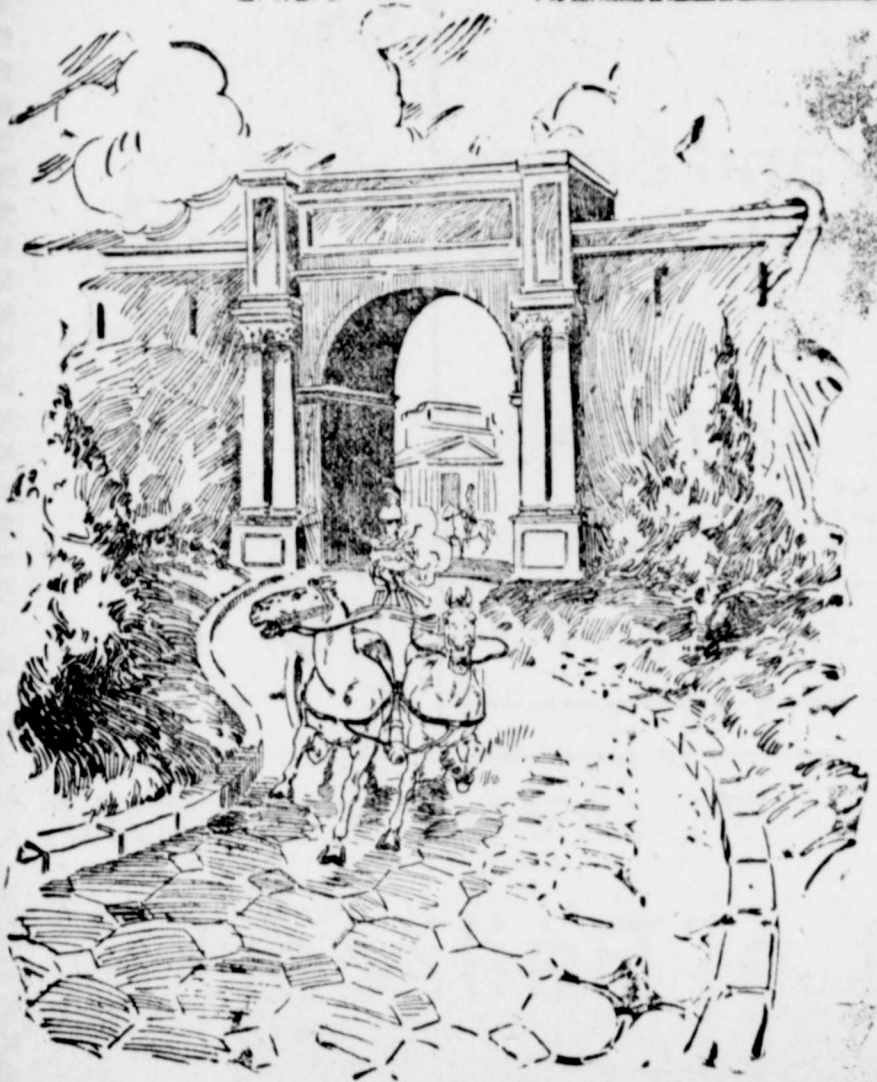
THE APPIAN WAY.

CAESAR built the Appian way and advanced Roman civilization to the zenith of its glory; Pericles found Athens a city of mud and left it a city of marble. Trace all the world movements for progress to their source and we will find a great man. The inspired thought of our builders has moved the wheels of civilization since the beginning of creation and the dawn of a glorious development that will illuminate the universe awaits the appearance in our state government of men who are builders.