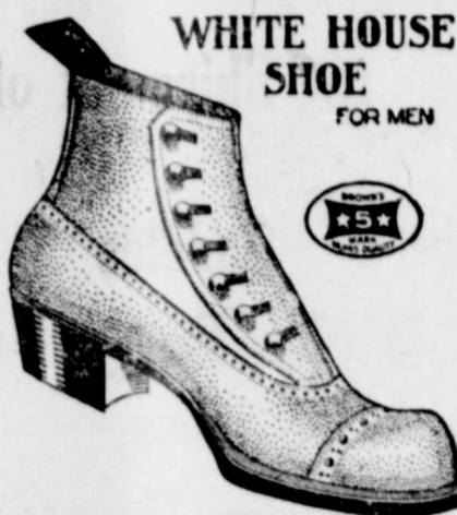
WHITE HOUSE SHOE FOR MEN

We were never better prepared with high grades and best styles in Fall and Winter Footwear