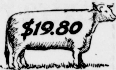
1910 VALUE PER HEAD $19.80.

The Texas steer fills the ladder of the civilized world; provides boots and shoes for the rich and poor of two hemispheres and our dairy products are a factor in the world's trade. No Texas product is so well and favorably known as that of our livestock industry.