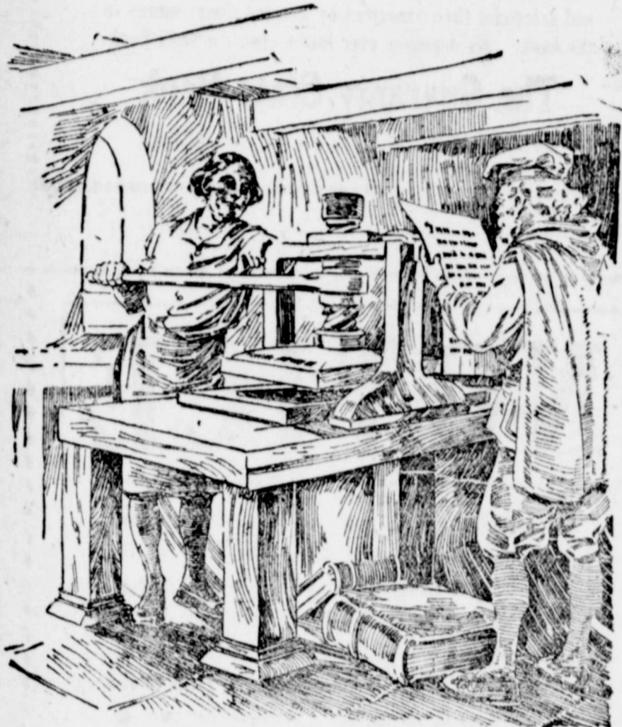
THE FIRST PRINTING PRESS.

THE Chinese made the first paper and the Germans made the first type and brought education within the reach of every citizen on the globe. These achievements, together with the printing press, were the crowning glory of civilization. The Texas press is a great industrial educator. To read our newspapers makes the farmer want to start another plow, the miner shoulder his pick, the manufacturer enlarge his plant and the banker increase his investments. Our marvelous progress is due largely to our inspired writers who sweetly sing the praises of Texas.