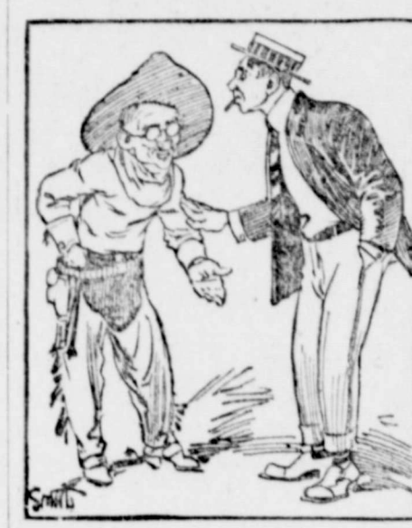
"You're a True Sport."

wear that silk running-suit. Who knows, maybe I can run!"