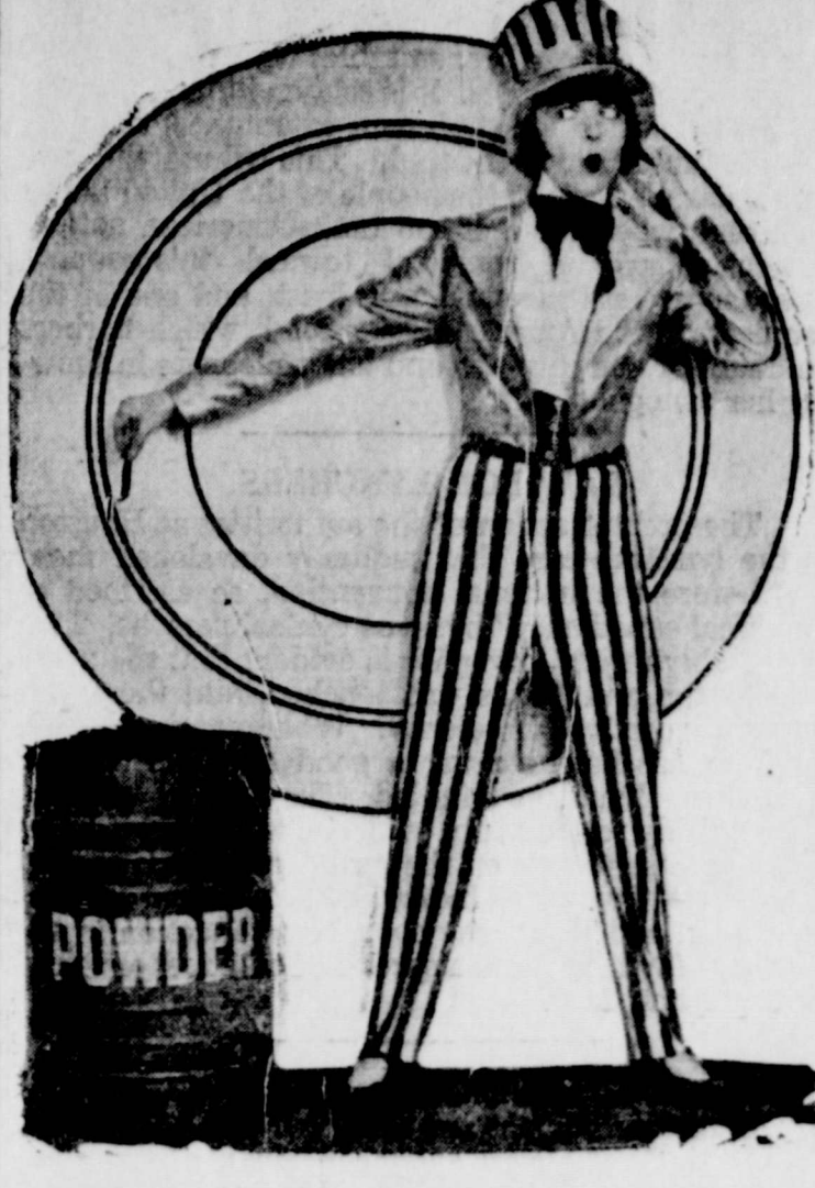
Pretty Colleen Moore makes a corking Uncle Sam as she prepares to celebrate the glorious Fourth in the old-fashioned way. But somebody ought to call an ambulance—just in case the big barrel of powder shoots the wrong way.