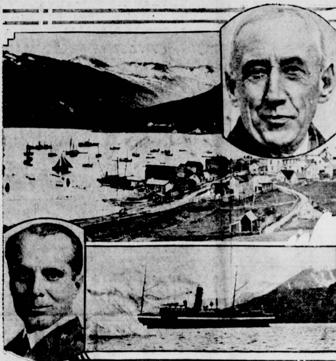
Aboard his supply ship City of Milan in Virgo Bay, Spitzbergen, Commander Umberto Nobili (below), rescued from a drifting ice floe by airplane, is directing fliers in their attempts to rescue other members of the Italia's crew. Above is an aerial view of Tromsø, Norway, whence Roald Amundsen, famous Polar explorer (inset), took off with René Guilbaud, French ace, in an effort to find Nobili. They have not been heard from since.