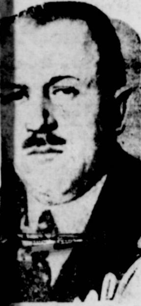
Marshal Pilsudski lends resignation as Polish Vice-Premier Kasimir above, immediately a new government Pilsudski retained the war minister. Now is expected to succeed as premier.

Everything O. K. Message RIO DE JANEIRO, July 3. — Captain Arturo Ferrarin and Major Carlo P. Del Prete, attempting a non-stop flight from Rome to Brazil, were only 600 miles off the Brazilian coast coast at 1:30 o'clock this afternoon. (Greenwich time) according to a radiogram from the British steamship Albion. Ferrarin had reported "everything o. k." the radiogram said.