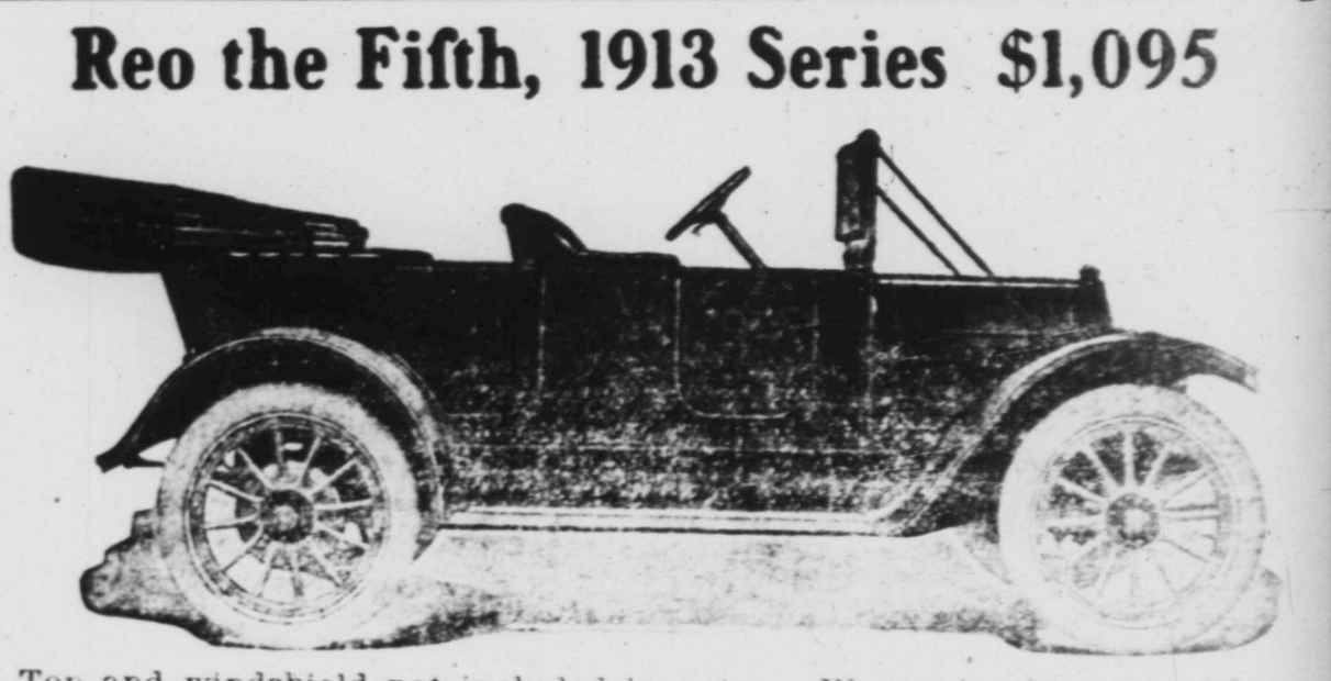
Reo the Fifth, 1913 Series $1,095. Top and windshield not included in price. We equip this car with rear hair top, side curtains and slip cover, windshield, gas tank for headlights, speedometer, self-starter, extra rim and brackets—all for $100 extra (the price $1,195).

Most men, I believe, would pay $100 for this center control alone. In Reo the Fifth it costs you nothing extra. Please study this car. When you come to know it half as well as I do, no lesser car will be considered by you.