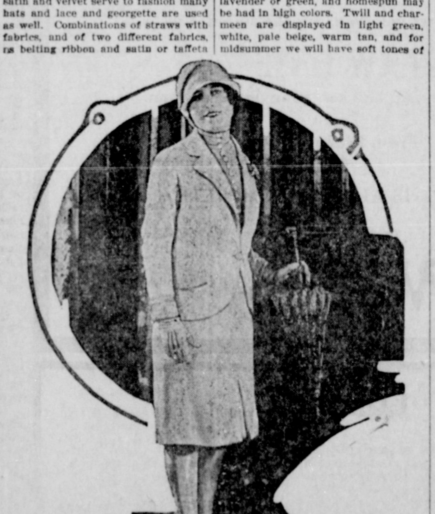
CALL CALL CALL New Version of the Tailored Suit.

popular. These are demanded in mannish and in dressier styles. Hair line stripes and checks are usually plain and severely tailored and there are many smart combinations of checks with plain materials. Cape suits and ensembles answer the call for dressier tailleurs. Innovations in the tailored mode appear in the introduction of livelier colors and new patterns in weaving. Tweeds are varied by fancy ing them. Besides straw and hair and tapestry patterns and by the inrs, as rosy tan. satin and velvet serve to fashion many lavender or green, and homespun may be had in high colors. Twill and charhats and lace and georgette are used as well. Combinations of straws with meen are displayed in light green, fabrics, and of two different fabrics, white, pale beige, warm tan, and for