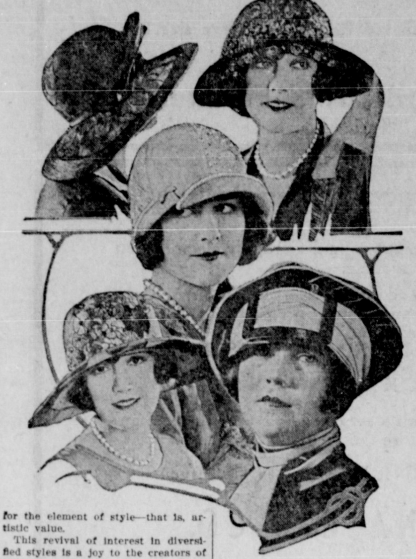
Showing Particular Style Value

wave in fashlon seems to roll, part in the season's style drams