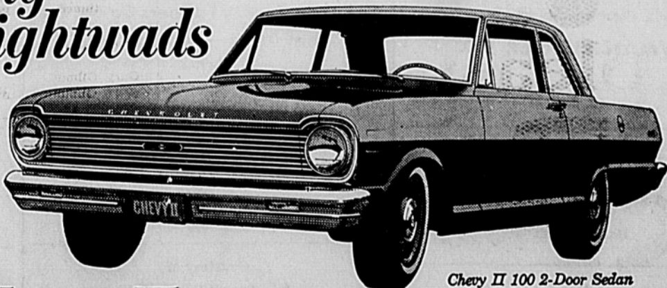
Chevy II 100 2-Door Sedan