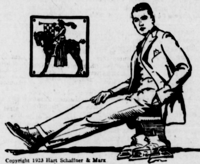
Copyright 1923 Hart Schaffner & Marx