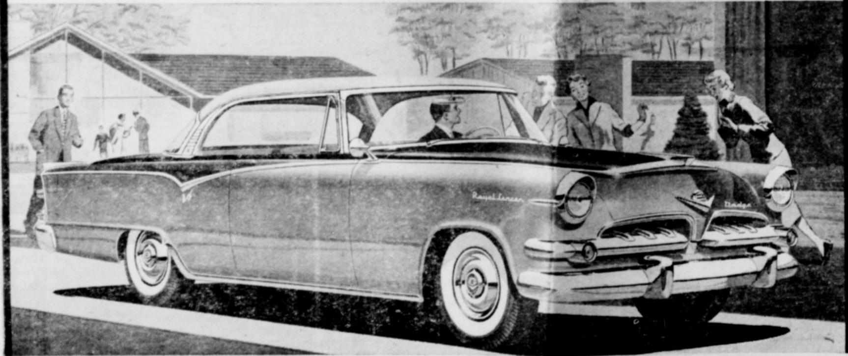
New Dodge Custom Royal Lancer in dramatic three-tone styling.

So head for your Dodge Dealer . . . and take your pick!