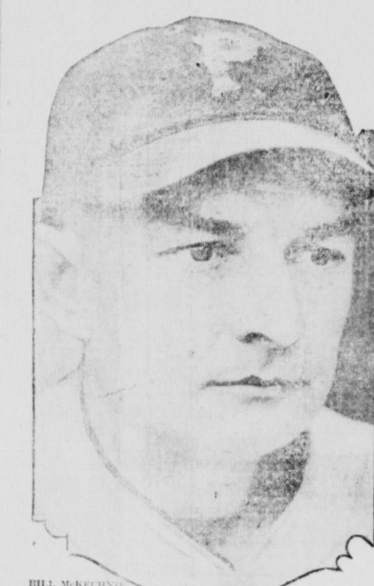
BILL MCKECNIE. He is the boss of the Pirate crew. He's a veteran aviator. He knows the game and how to get the best work out of his charges. He took charge of the Pittsburgh dirigibles in June, 1922, and has done well.