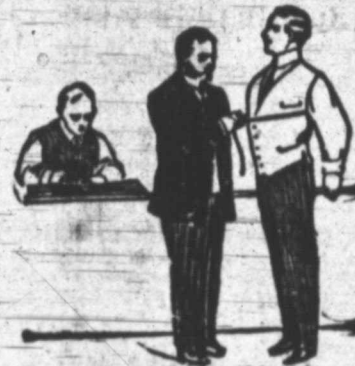
Getting a line on his curves

If you are hard to fit let us take your measurements. We guarantee to fit you.