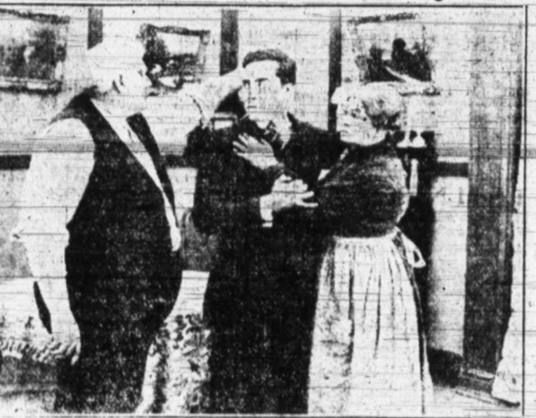
Scene from "Silver Threads Among the Gold," at Majestic, Wednesday 12th.

Mrs. Leslie Carter in "The Heart of Maryland" is the Tuesday feature at the Empress Theatre. "The Heart of Maryland" was directed by Herbert Brenon, producer of Neptune's Daughter, and required five months to complete. For the making of this picture, Director Brenon was given entire blank freedom by the Tiffany Film Company, and used five regiments of infantry men, three battalions of cavalrymen, two corps of artillery and consumed seven tons of gunpowder to create the proper atmosphere in the many battle scenes. All over five thousand people took part in the picture, which is said to have cost in excess of one hundred thousand dollars. Mrs. Carter portrays the role of Maryland