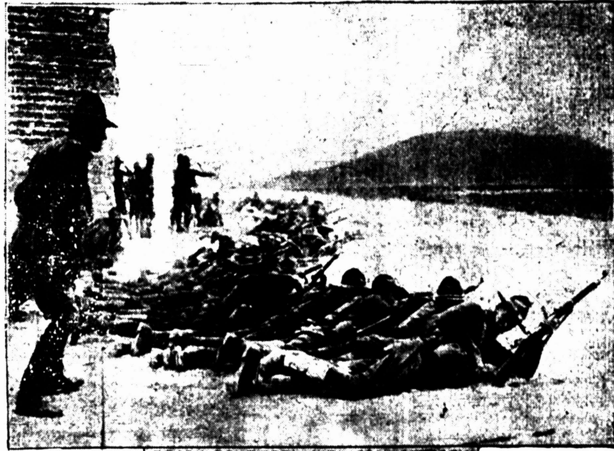
READY TO REPEL MEXICAN ATTACK

Officers of the expeditionary force among other things, issued orders that the men should take with them only such equipment as they could carry on their backs or saddles. Extra clothing and the army surplus kit will be left behind. These orders were intended to limit carrying facilities to the essentials of the ex-