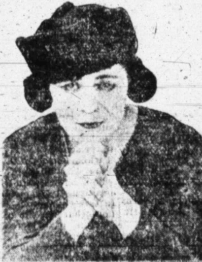
Valeska Suratt in "The Immigrant." Empress Monday.

COMING WEDNESDAY—The Electrophone, the latest and greatest invention in Talking Pictures. 10c-20c.