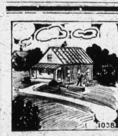
AMERICANS ARE A NATION OF HOME BUILDERS

FOR SALE—Baby chicks. Phone 907-3fc Rural. 272-3fc