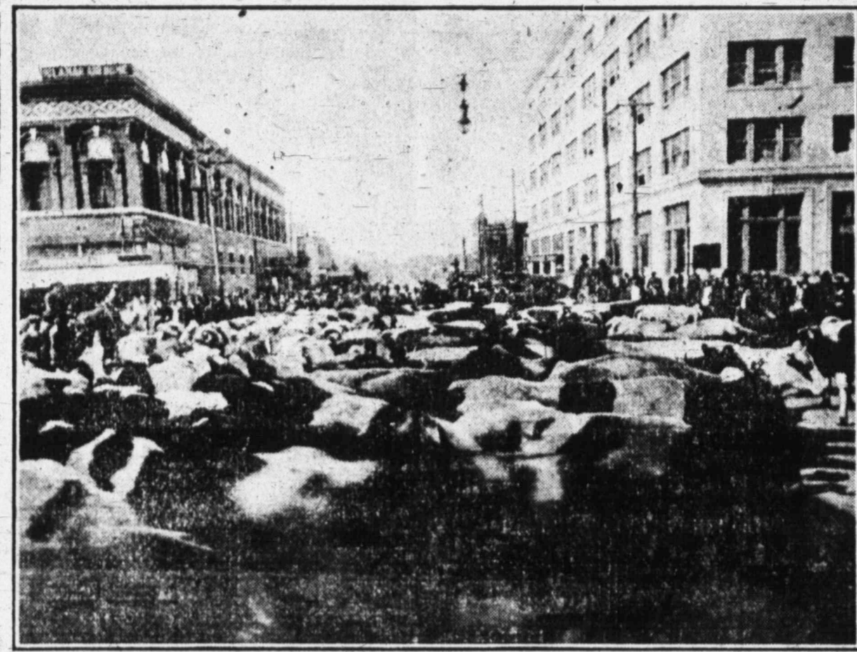
Above is shown the herd of 750... The Chamber of Commerce, expressed at the annual meeting in January...