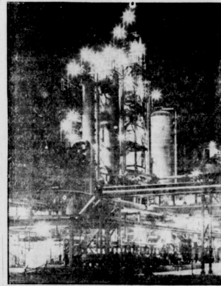
IT'S TEXAS, NOT TIMES-SQUARE — The lights of a new lubricant refinery at Beaumont, Tex., blaze in the night. These bright lamps are in the plant's phenol unit where petroleum is treated to free high-quality oils by dissolving low-quality oil.