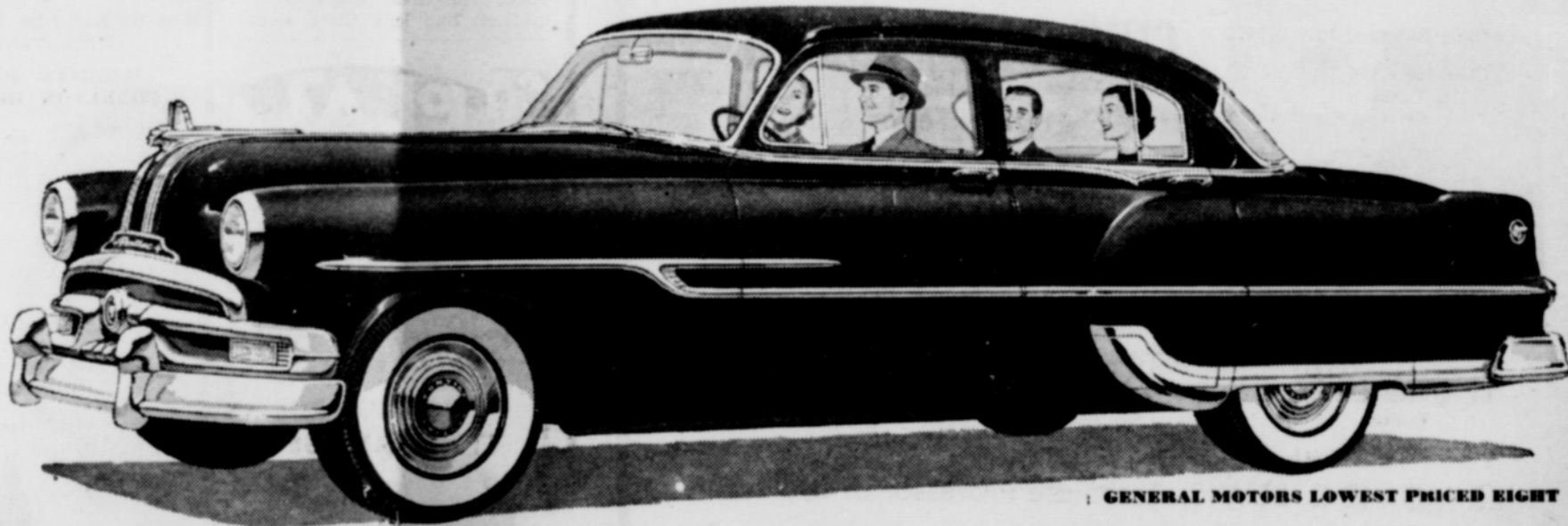
GENERAL MOTORS LOWEST PRICED RIGHT

In all-around performance, Pontiac compares favorably with any car—and you get this performance along with an unsurpassed record for dependability, economy and long life. But Pontiac compares with the finest cars in other ways, too: in handling ease, in comfort, in roominess. All this makes Pontiac's low price even more remarkable. And not only is Pontiac priced right down next to the lowest but it also saves you money every mile you drive. And to top off Pontiac's low cost you can look ahead to its assured high resale value. Why not come in and let us prove it?