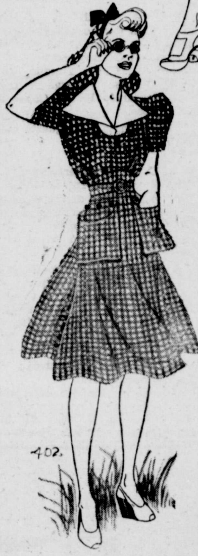
No. 402—A Marcy Lee Junior Check in Fiberdown fabric, with new apron pockets. The white organdie collar and contrasting buttons lend an air of quality. Black, red, or copen with white. Sizes 9 to 15, $1.98.