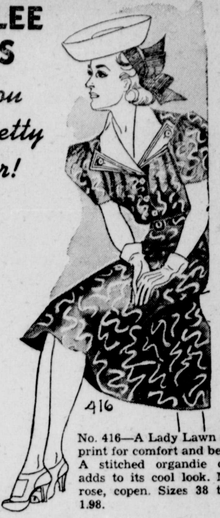
No. 416—A Lady Lawn swirl print for comfort and beauty. A stitched organdie collar adds to its cool look. Navy, rose, copen. Sizes 38 to 44, 1.98.

Over 200 brand new crisp cool summer Marcy Lee dresses just unpacked. See our collection!