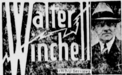
Portrait of a Newspaper