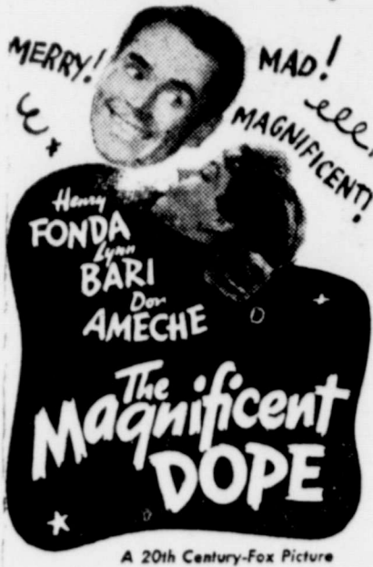
A 20th Century-Fox Picture