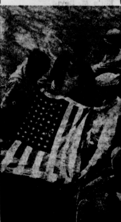
Old Glory serves. Philippine Americans use flag to identify themselves when seeking food and munitions on Navy L.I.C. War Bonds helped buy the supplies they received. U. S. Treasury Department

Print the complete address in plain block letters in the panel below, and your return address in the space provided. Use typewriter, dark ink, or pencil. Write plainly. Very small writing is not suitable.