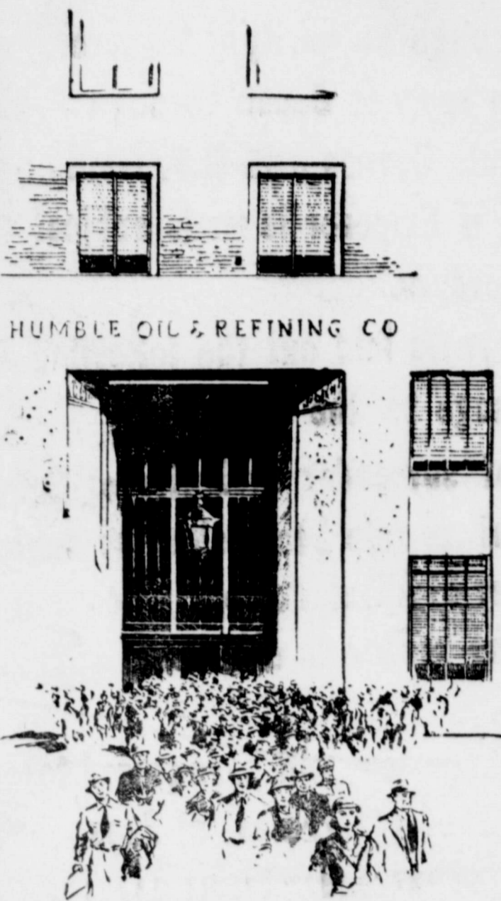
HUMBLE OIL & REFINING CO

The war production record of Humble employees, in the field, in plants and in offices, is a magnificent climax to a quarter of a century of teamwork by a great organization. In this team are scientists, drillers, roustabouts, stenographers, geologists and glassblowers; men and women in hundreds of occupations, all working toward one goal—supplying Oil for Victory.