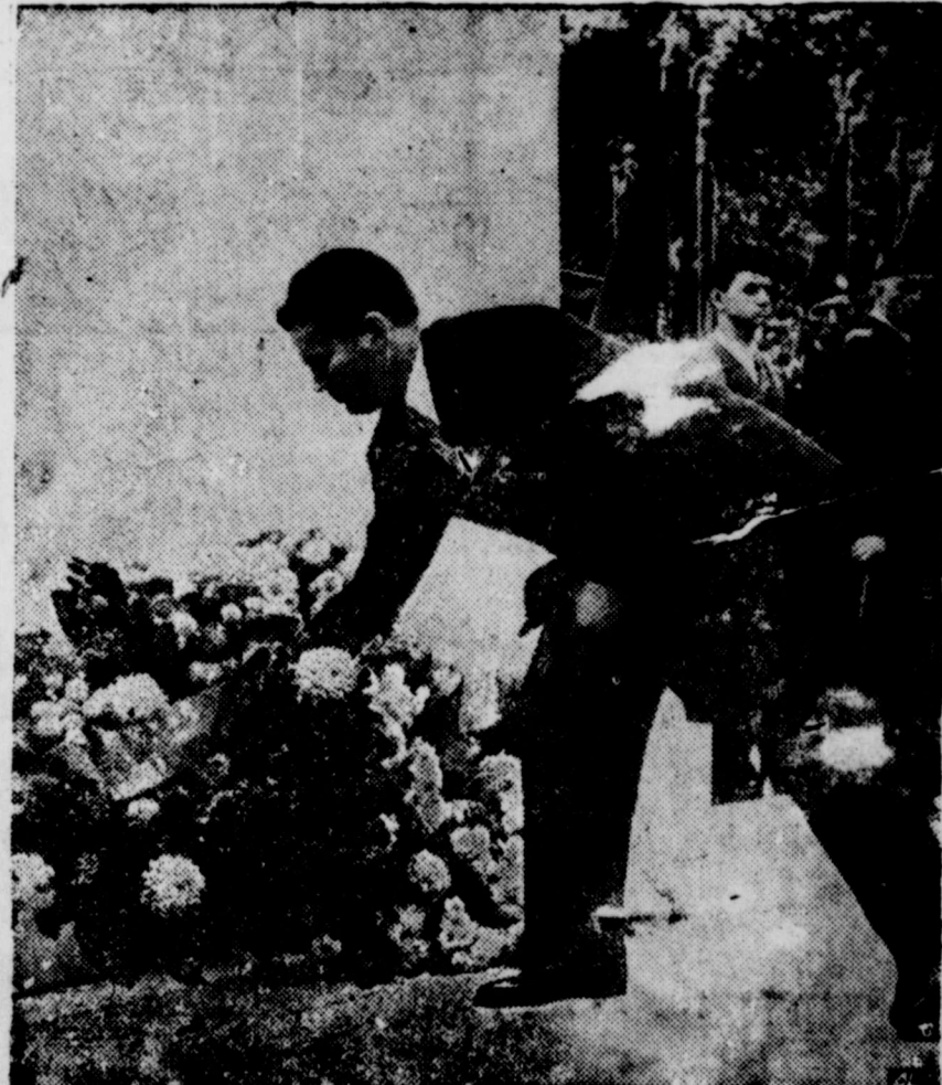
Rep. Olin Teague (D-Tex.) a wounded veteran of fighting in France and Germany in World War II, places the Texas American Legion wreath on the tomb of the Unknown Soldier at Arlington National Cemetery during Armistice Day ceremonies.