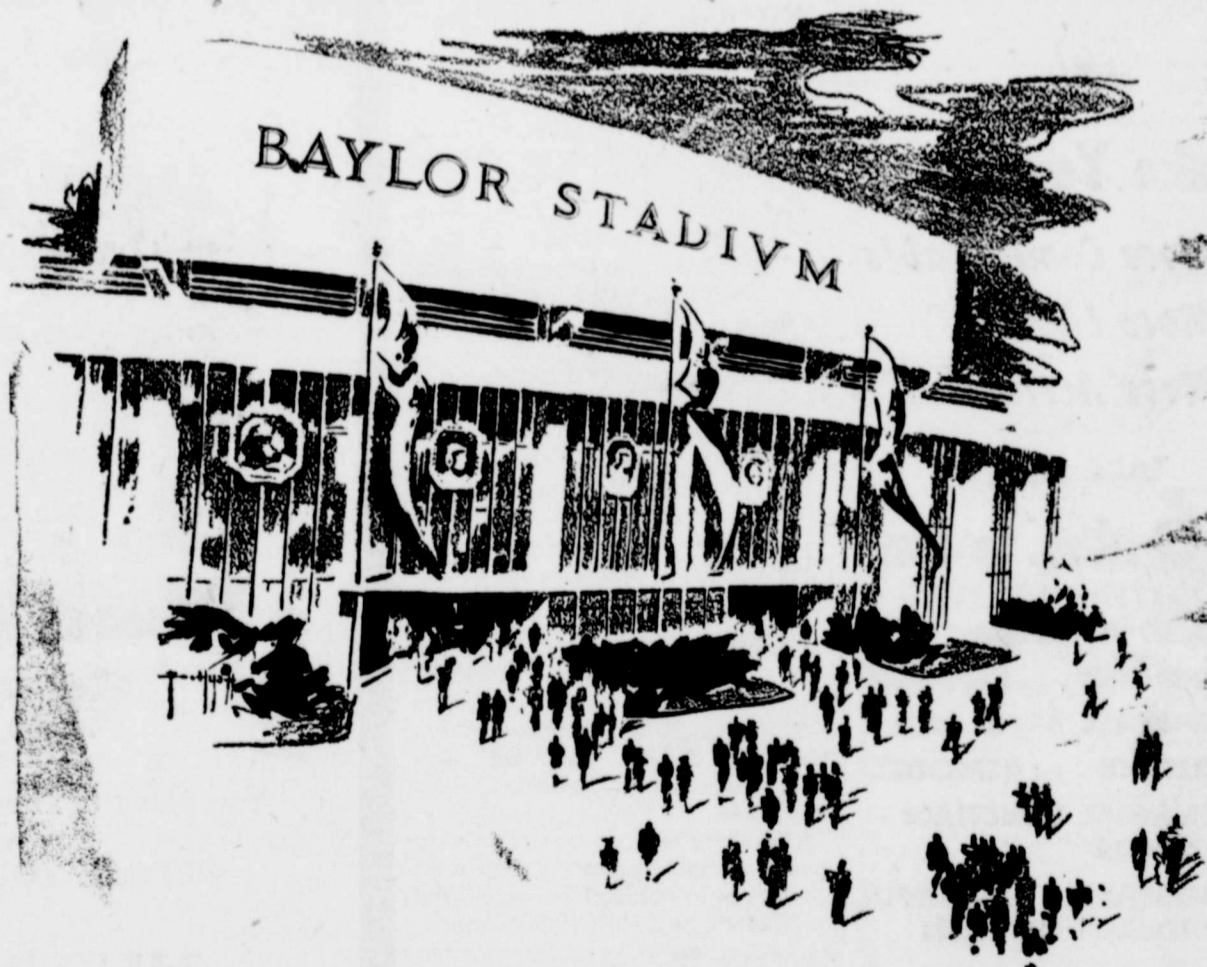
This is the architect's conception of the entrance to the new $1,500,000 Baylor University Stadium, which will seat more than 40,000 when completed on the 100-acre tract in Waco, home of the Baptist Institution. The ground-breaking ceremony will be held in Waco Saturday, at 5 p. m. Ex-students, prominent Baptists, and friends of Baylor from all parts of Texas have been invited to attend.