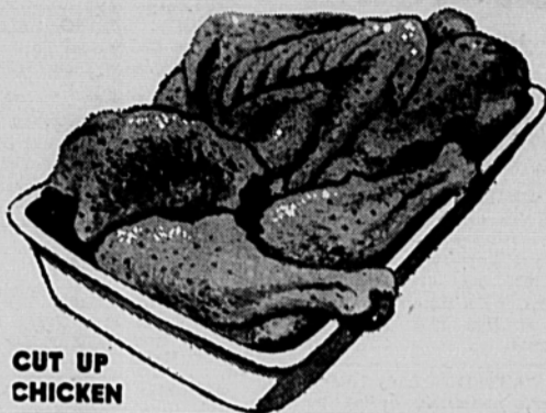
CUT UP CHICKEN