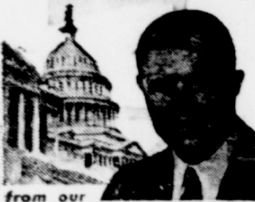
from our Congressman BOB POAGE