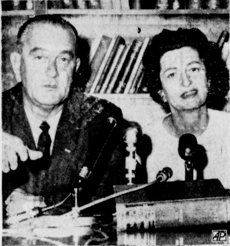
EXPRESS REGRET OVER RAYBURN ILLNESS—Vice President Lyndon Johnson and Mrs. Johnson are shown at press conference in Baylor Hospital in Dallas after they visited the ailing House Speaker Sam Rayburn. The Vice President expressed deep concern over the illness of Mr. Rayburn.