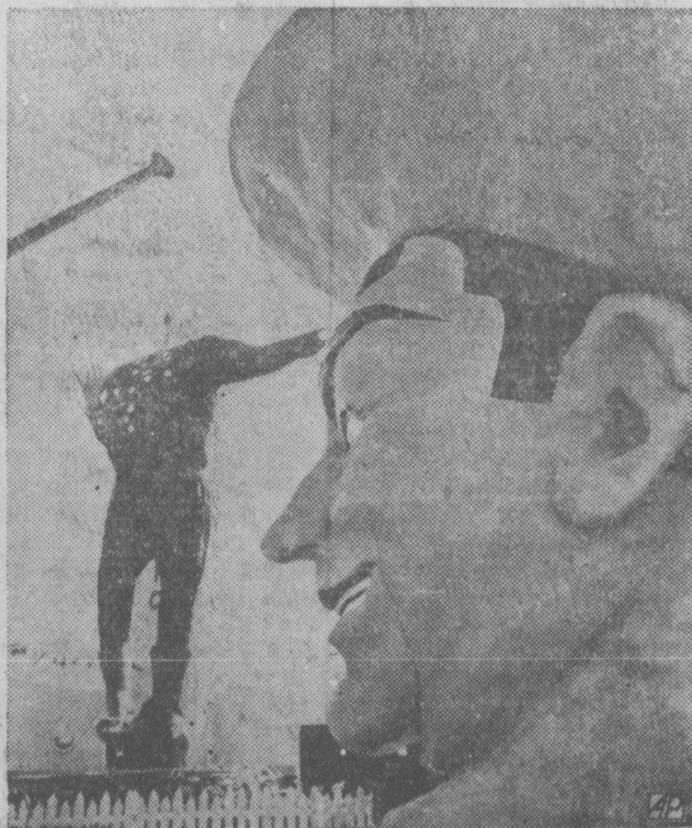
FAIR SYMBOL GOES UP — to take shape at his usual stand "Big Tex" the long-time symbol on the fair grounds in Dallas.