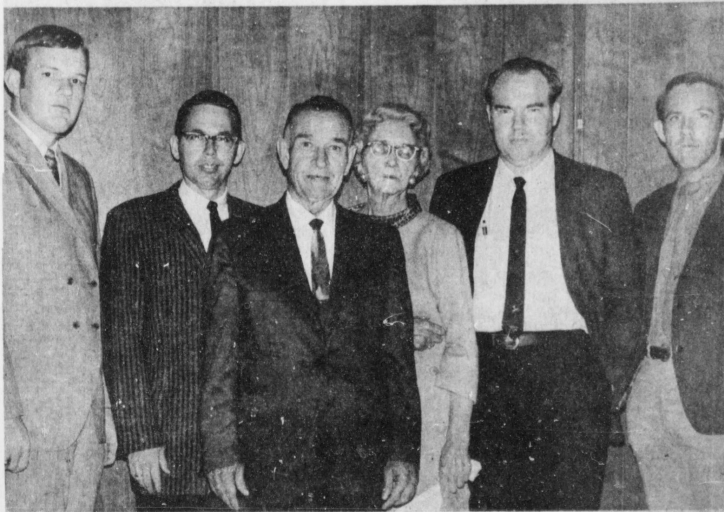
American Cancer Society