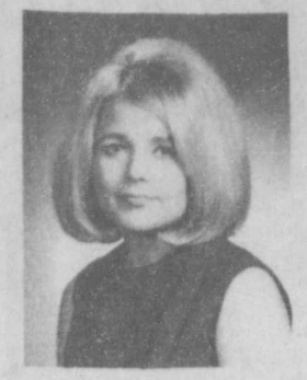
by sally jund

STUDY FOODS AND NUTRITION...Where does a girl learn the basics of food sciences—4-H Club; Where does a girl learn the basics of preparing a well balanced meal—4-H. The objectives of 4-H Clubs across the country are to ready the youth of America for the hurdles ahead in life. One such 'bump'' is understanding the science of cooking.