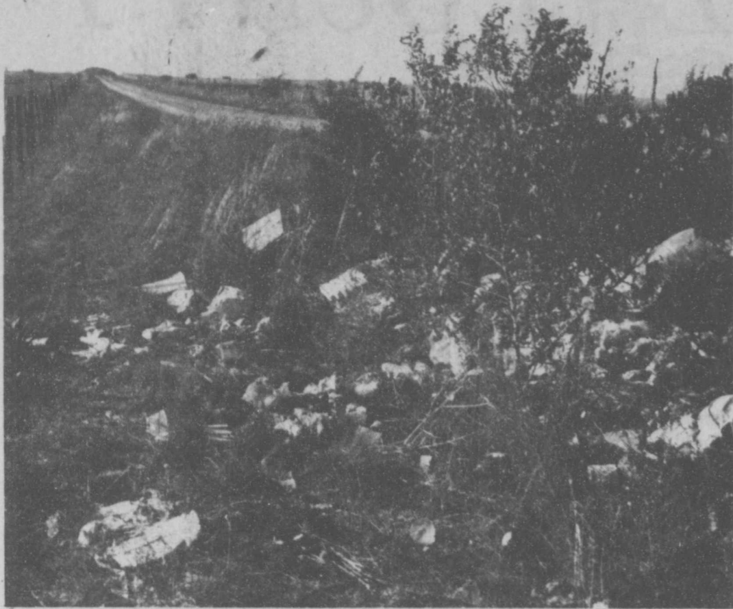
Trash piles like the one pictured above are commonplace along many of our Coryell County roads. Above it seems as though the concealment of the trash from view was aimed at remaining the problem forever. However, the problem remains and is added to as more and more persons use the spot to dump.