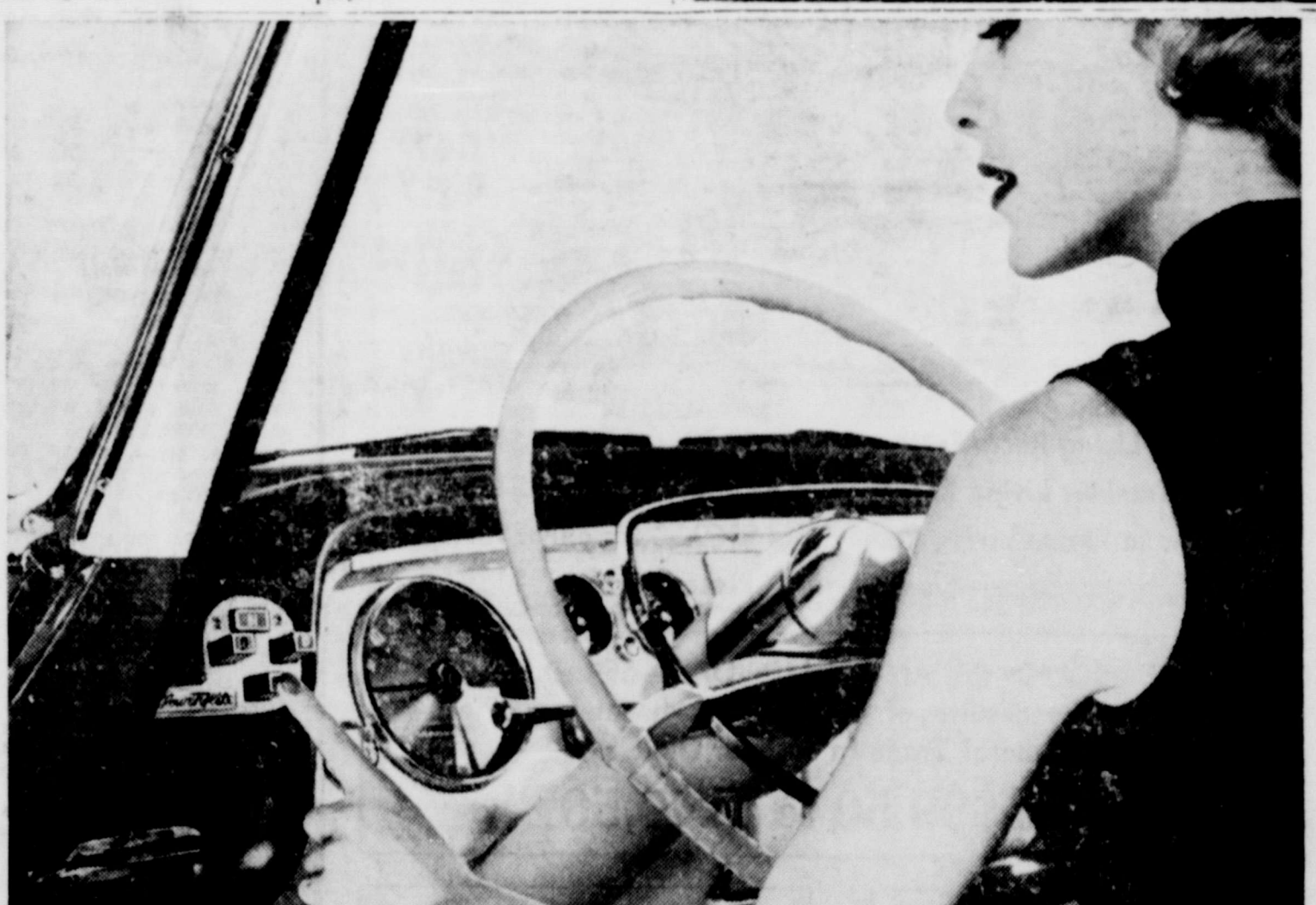
29 Plymouth models, including an all-new line of Suburban station wagons in 3 low price-ranges, all with fabulous new Aerodynamic Styling.