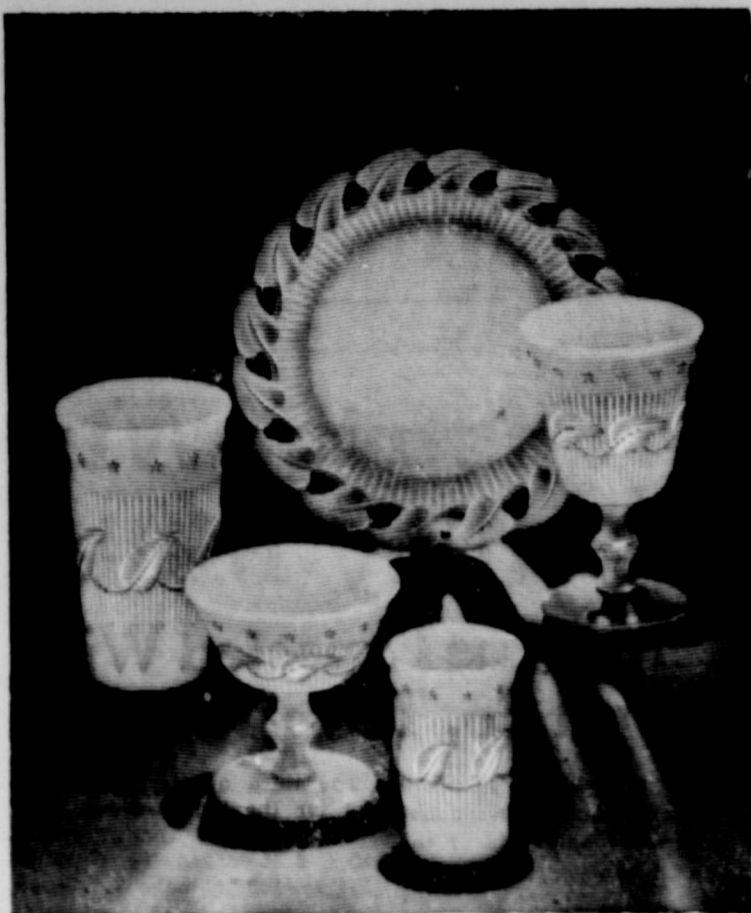
Milk Glass... by