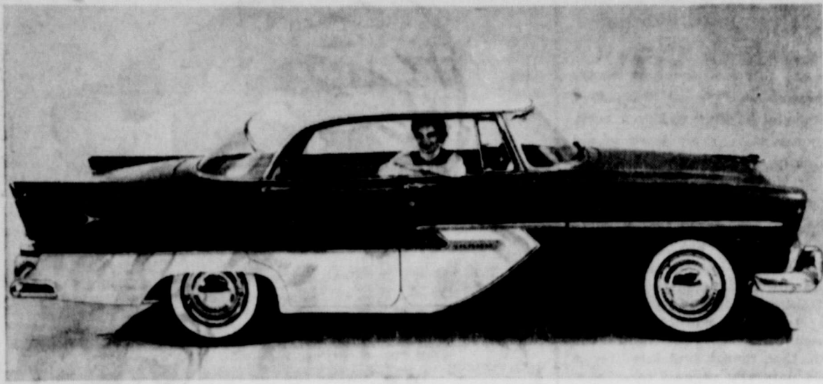
Belvedere four-door hardtop is an entirely new model introduced by Plymouth in its 1956 line of cars. Aerodynamic styling, push button driving and powerful new Hy-Fire engine are among outstanding features. Safety door latches and other safety items are standard equipment.