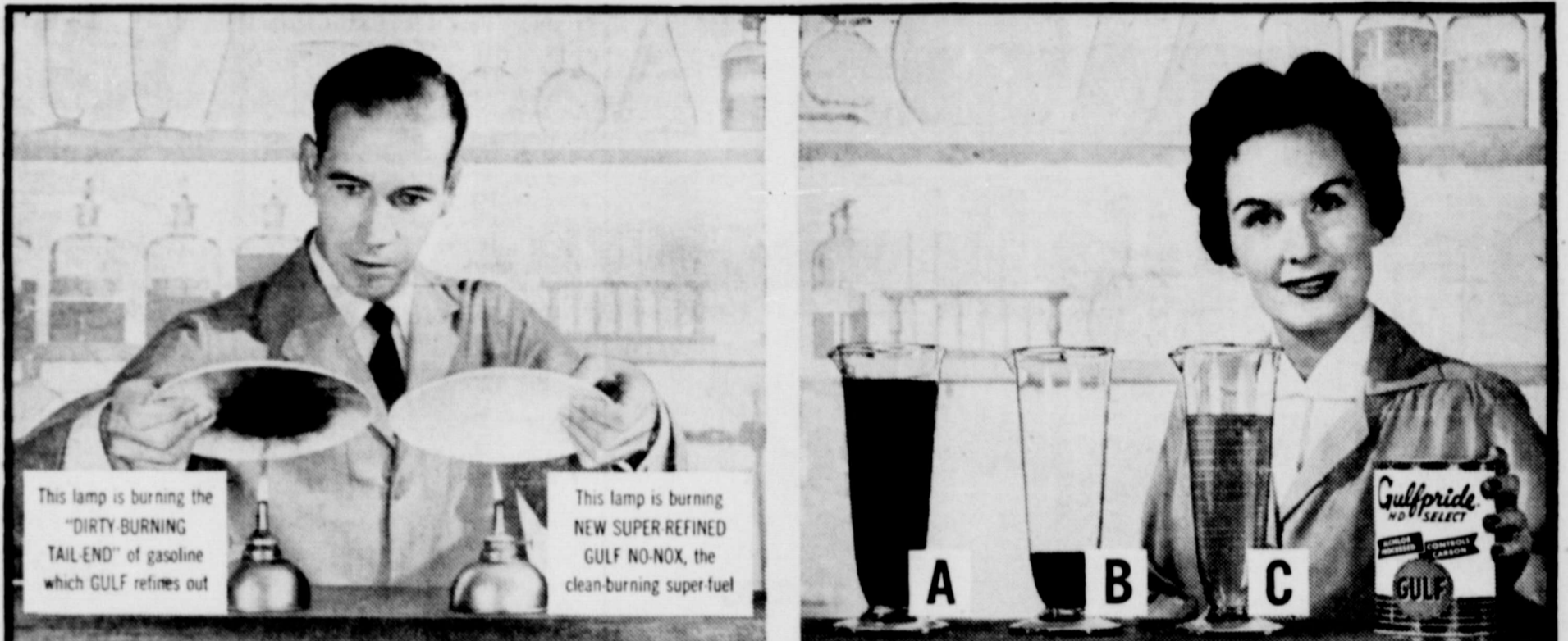
This lamp is burning the "DIRTY BURNING TAIL-END" of gasoline which GULF refines out

gives you more miles per gallon... more miles per quart