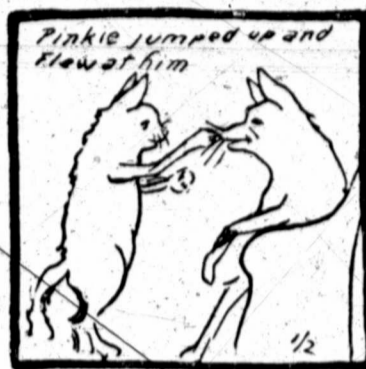
Pinkie jumped up and flew at him.

Mr. Fox was tired of living alone in the woods and he wanted to support anyone. He was tired of doing his own work and thought a wife would make it easier for him.