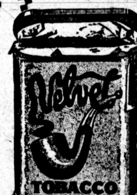
Roll a Velvet Cigarette Velvet's nature-aged mildness and smoothness make it just right for cigarettes.

Investment vs. Speculation—Which? We deal in PRODUCING royalties only, which eliminates any element of gamble from our proposition. Now paying substantial dividends monthly. Limited amount of stock to be sold at par.