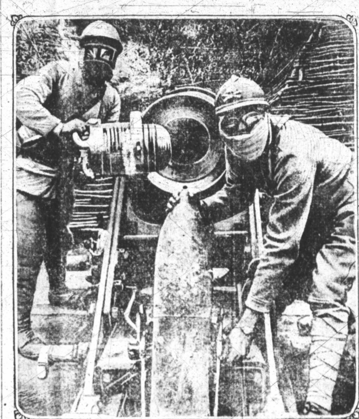
FRENCH READY TO FIRE UPON THE ENEMY

The photograph, made recently near the Somme, shows French gunners setting a shell of 155 millimeters. The men, equipped with gas masks, are in a very dangerous section, as may be seen by the bracelet on the wrist of the one on the right of the picture.