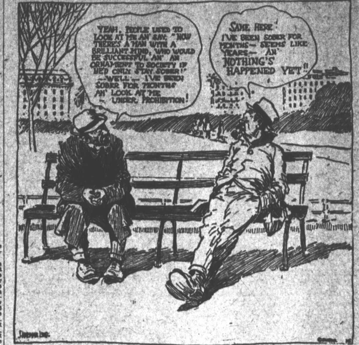
YEAH, PEOPLE USED TO LOOK AT ME AN' SAY, 'NOW THERE'S A MAN WITH A BRILLIANT MIND, WHO WOULD BE SUCCESSFUL AN' AN ORNAMENT TO SOCIETY IF HE'D ONLY STAY SOBER!' --WELL, I'VE BEEN SOBER FOR TWENTY AN' LOOK AT ME UNDER PROHIBITION!