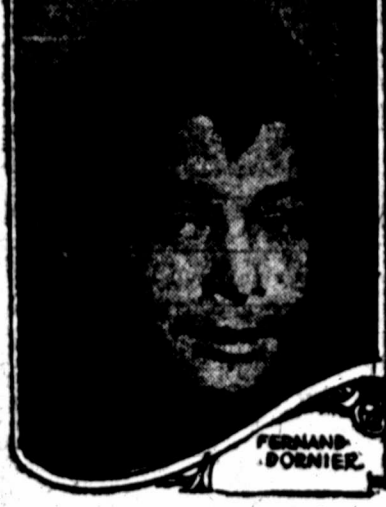
Determine to make his future home in this country despite as fully a strong determination upon the part of the immigration authorities that he must return to France...