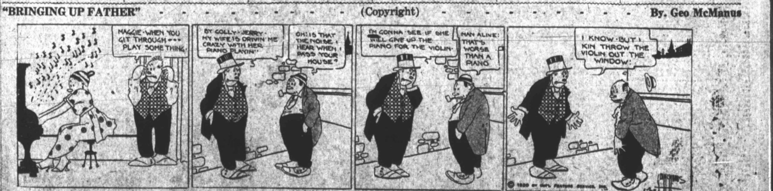
By Geo McManus