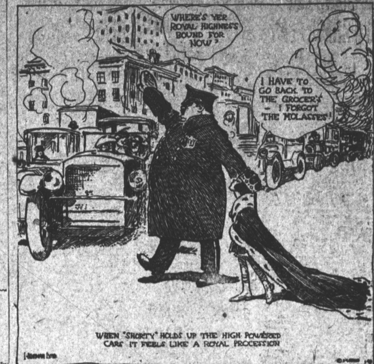
WHEN "SHORTY" HOLDS UP THE HIGH POWERED CAR, IT FEELS LIKE A ROYAL PROCESSION

and a sudden reaction from the extravaganza immediately following the war is prophesied. Dress will undergo many changes. If the stars are read aright, and beauty will rule the fashions, which will be extremely modest. As the year progresses a national movement in which women are concerned will grow so that it becomes preponderant in public affairs.