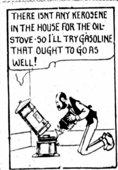
THERE ISNT ANY KEROSENE IN THE HOUSE FOR THE OIL STOVE—SO I'LL TRY GASOLINE THAT OUGHT TO GO AS WELL!

THE SHERWIN-WILLIAMS Co. Brighten-Up Store 818 Ohio Avenue. Phone 24.