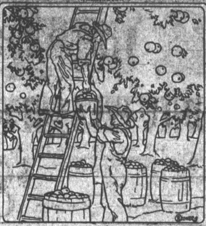
The quantity and quality of its apples is so great. That Washington is noted as an apple-growing state.