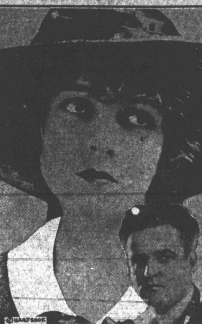
BLANCHE SWEET AND MARSHALL NEILAN

CHICAGO, June 9.—Blanche Sweet, motion picture actress, Marshall Neilan, her director, were married here Thursday and departed for New York where they will spend their honeymoon. The marriage took place in the office of the county clerk.