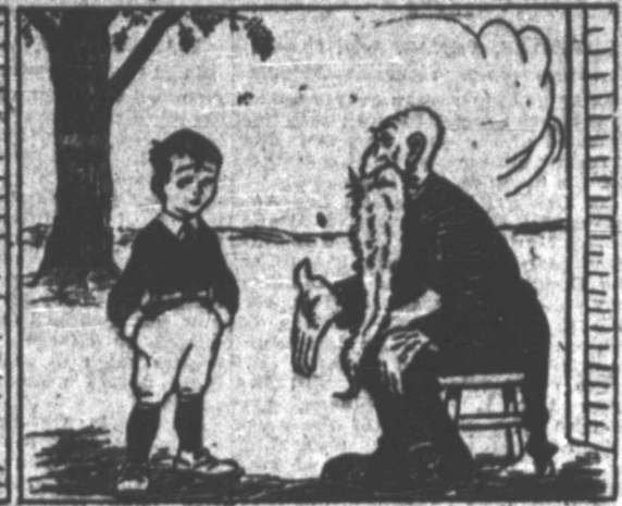
WELL, ONE BY ONE FROM A YOUTHERY SHARPLY SHOT THEY WILL NEVER HERE YOU I CAN'T THE LANGUAGE OF ALL THE ANIMALS AND CAN CALL THEM TO ME AT ANY TIME, NOW WATCH A DEER COME.