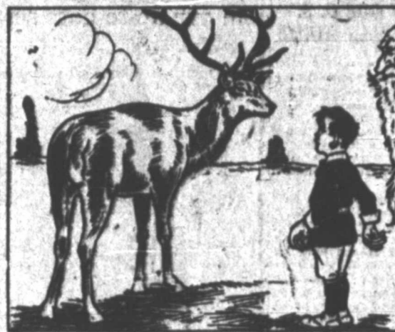
AND THE BUCKS, SHORTLY AFTER THE OLD MAN HUNTED A STUBBLE BEAR APPROXIMATELY IN THE MIDDLE AND CAME RUNNING RAPIDLY TO HIMSELF THEY WERE STANDING, NOW WILL CALL A WOLF, AND THE OLD FELLOW.