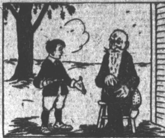
LITTLE JACK HAS OFTEN WONDERED WHY THE FUTURE HOUR HE OLD MAN WOULD EVER BE ABLE TO STAY OUT IN THE OPEN COUNTING THEM MUST BE WILD ANIMALS HERE, THOUGHT JACK TO BE SURE ABOUT IT.