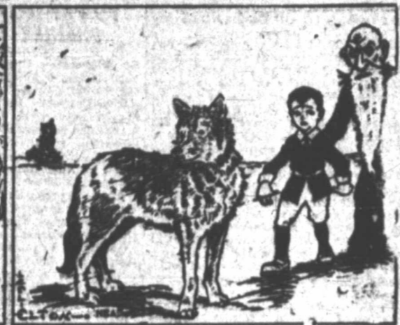
WELL, WHO A BY FRAGMENTED WHEN THE WOLF COME, SAW THE BUCKS ONLY LITTLE HE MADE THROUGH THE WOODS HE WILL CALL BY BARKING AND HE CAN MAKE YOU FEEL THE WOLF ALONG ON YOUR TRAIL, NOW.