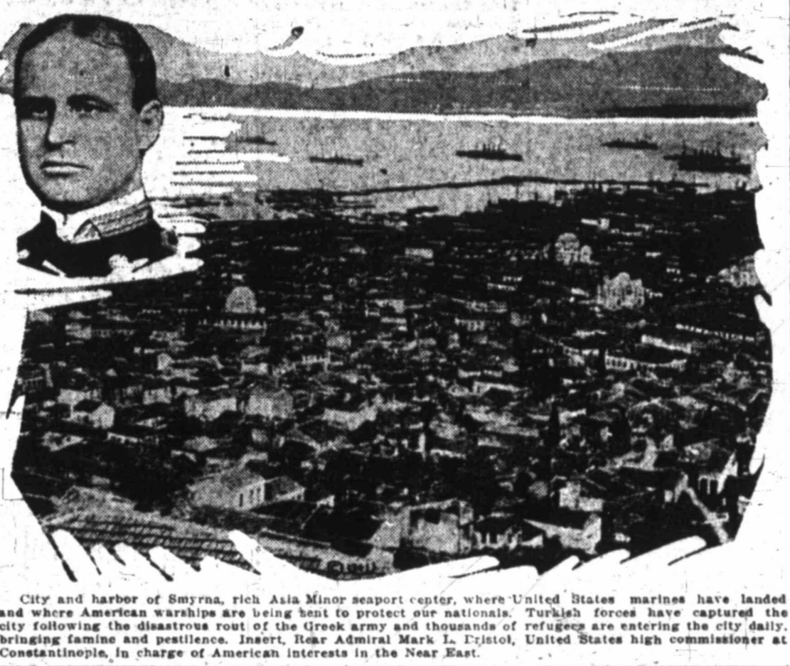
City and harbor of Smyrna, rich Asia Minor seaport center, where United States marines have landed and where American warships are being bent to protect our nationals.