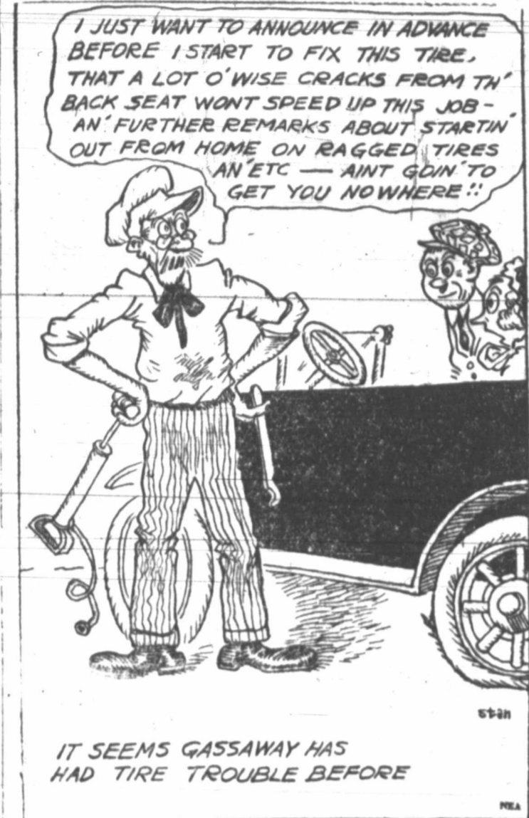
IT SEEMS GASSAWAY HAS HAD TIRE TROUBLE BEFORE