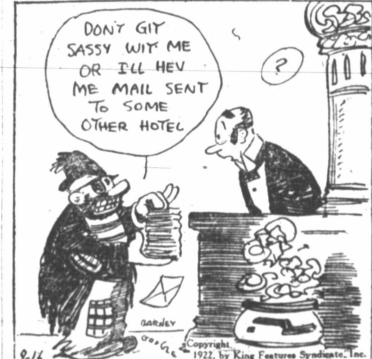
DON'T GIVE SASSY WIT ME OR I'LL HEV ME MAIL SENT TO SOME OTHER HOTEL