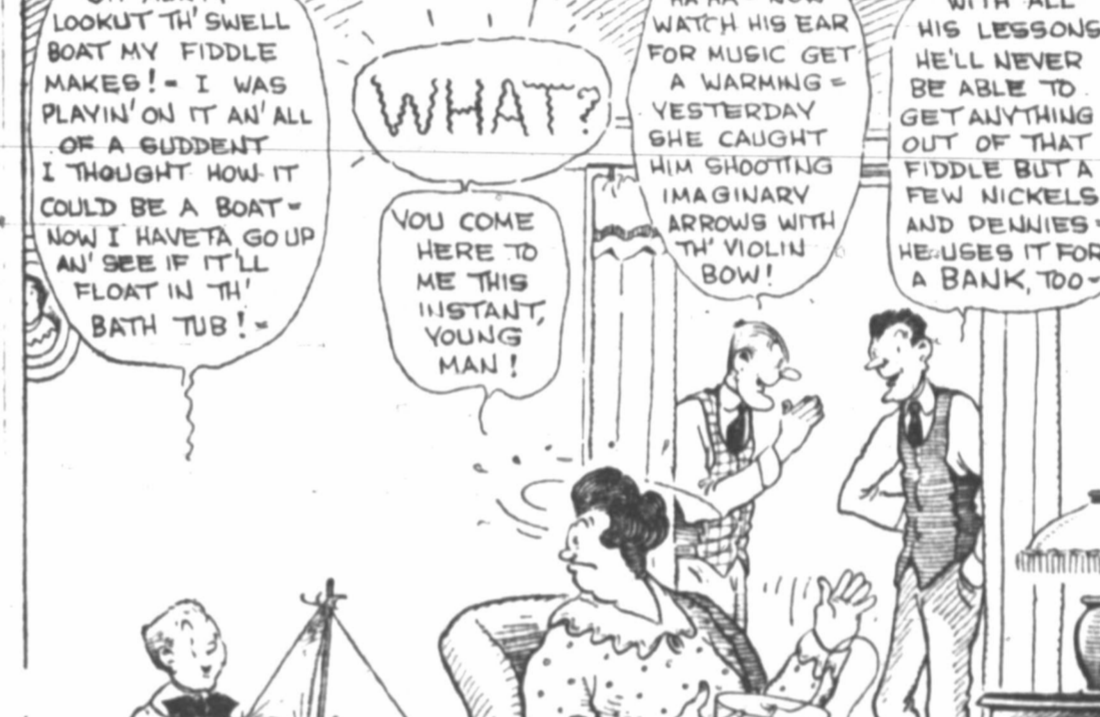
ALVIN PLAYS A TRICK VIOLIN