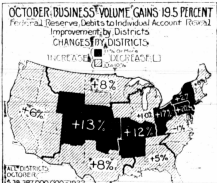
OCTOBER BUSINESS VOLUME GAINS 19.5 PERCENT Federal Reserve, Debits to Individual Account Revised