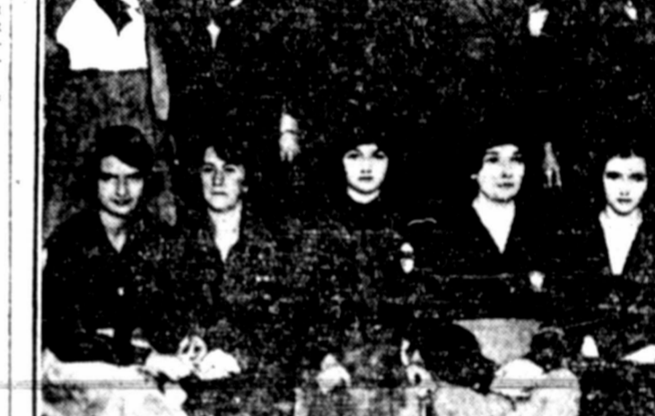
Clad in the "militaria nera"—the black-shirts of the Fascisti—women have flocked to the support of Mussolini's government. The picture above shows one of the first meetings of the women's auxiliaries.