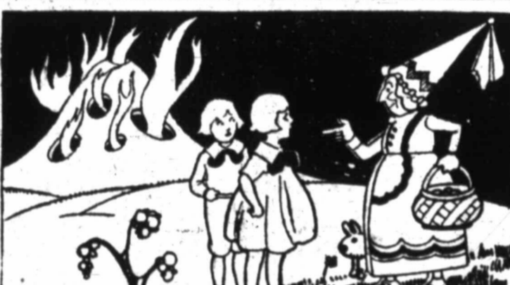
Off went Nancy and Nick toward Jack Straw's palace in Mix-Up Land.

The models sketched show the pointed front panels and jabot draperies worn and shown every where.