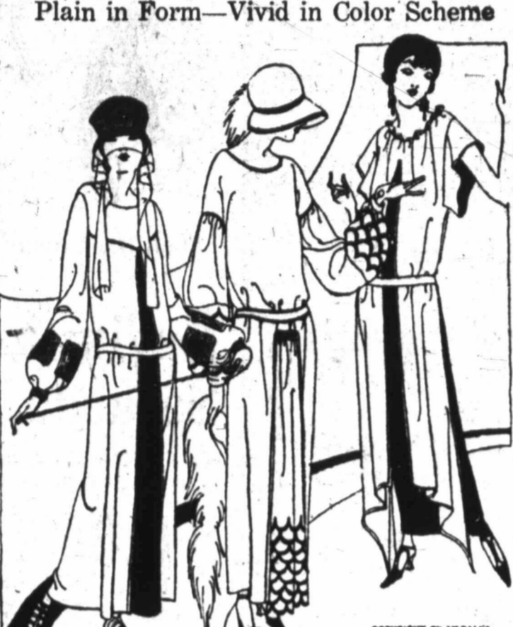
Most of the new frocks are trimmed in front and severely plain in the rear.