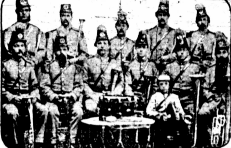
THIS BAND WAS A SENSATION in Bryan, O., in 1915—but nothing to what it would be if its members marched down our streets today. Officially, the organization was known as the North Western Silver Cornet Band. Notice the shape of the horns then in vogue.