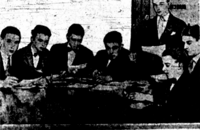
experience (and, incidentally, there are few "grown ups" who could write a better letter)

Boys Take Over Directorship of Big Corporation