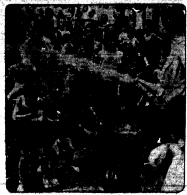
Probably no group of people suffers so much from the heat as the tenement dwellers of New York's East Side. The city treats the kids to a cooling shower each hot day, as shown here.